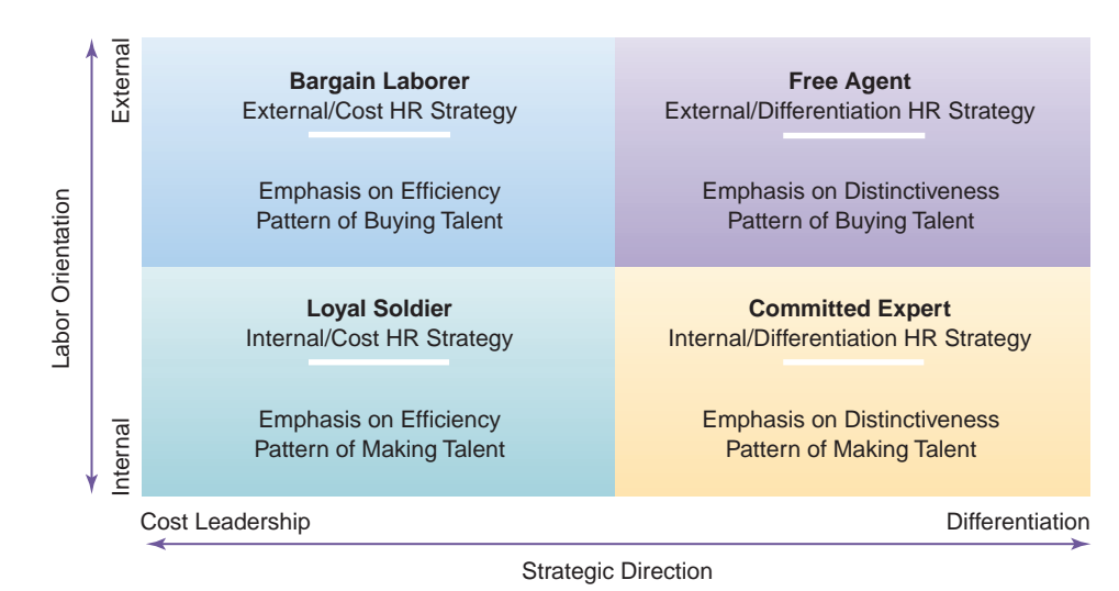
Figure 2.3 Strategic Framework for Human Resources.

A human resource strategy that combines emphasis on longterm employees with a focus on reducing costs (an internal/cost approach).